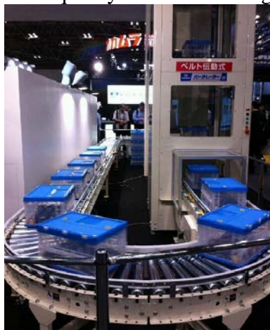
Figure 2 Automated production line

Through the application of automation technology, the mechanical equipment of each production link is connected with the communication technology network, and the operation of the individual mechanical equipment is combined into a unified control platform, which simplifies the step by which the human resources operate the mechanical equipment. And the mechanical design and manufacturing process has been more refined and intelligent changes. has obvious promotion effect on production efficiency and production quality. As shown in figure 2: