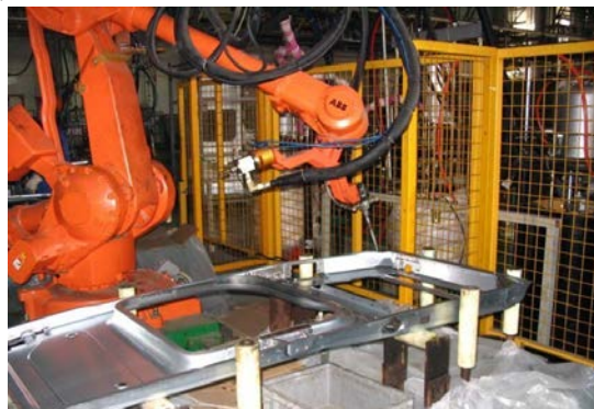
Figure 3 Manipulator in automation technology control

Intelligent technology is one of the directions for the future integration of automation technology. Through the mature application of information technology, the concept of intelligence is integrated into automation technology. The comprehensive level of design and manufacture of mechanical equipment is greatly promoted. In a sense, artificial intelligence technology, intelligent technology and automation technology are the important components of intelligent machinery production in the future. As shown in figure 3: